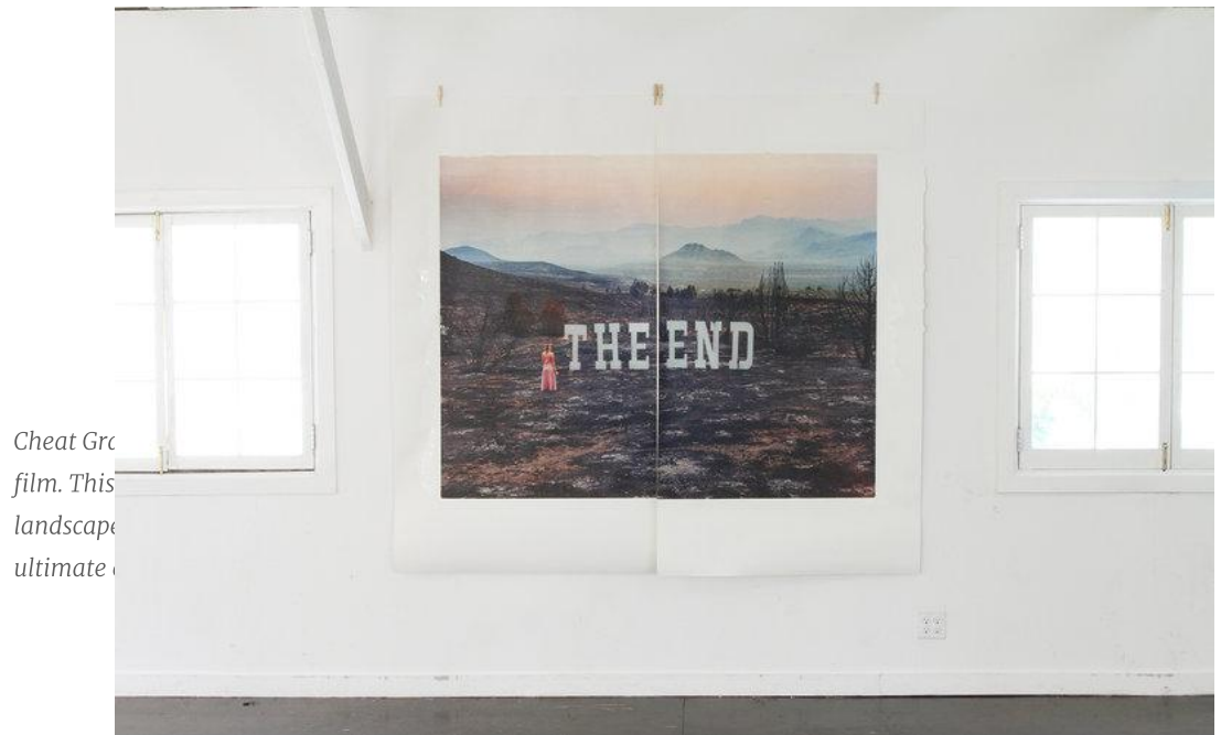
Cheat Gr film. This landscape ultimate

Norway! Please get ahead of this. It is sheer luck that an oil-exporting nation has been spared the worst of climate fallout.